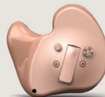
Oticon Own ITE FS (Full Shell)